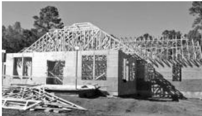
Raising the roof.