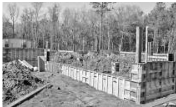
Clearing the way (Wellness House trailer in background).

The Outreach undertook a $3.5 million Capital Campaign to secure funds for the replacement of the trailer that currently serves as the Wellness House with a more spacious,