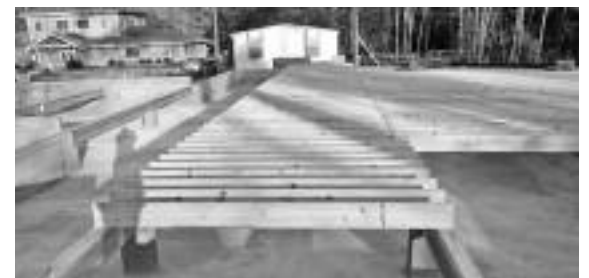
Laying a strong foundation.

The capital expansion effort of the Outreach will allow for greater pre-natal and women’s health